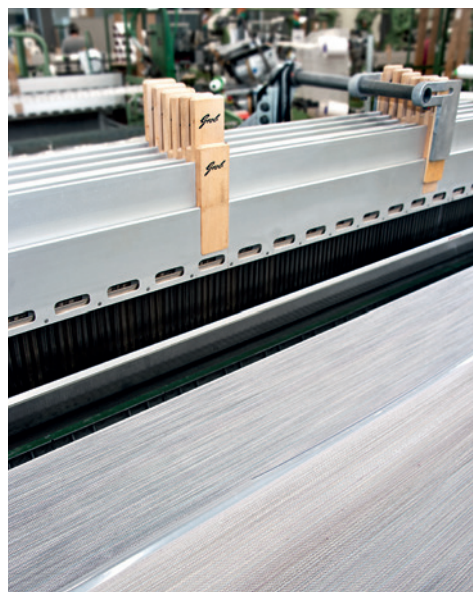
Ambiance made in Switzerland: ZETACOUSTIC fabric production

From development and design to preparing the yarn, weaving and finishing, Création Baumann acoustic fabrics are created in their own design studio and production facility in Langenthal, Switzerland. The wide range of products allows great flexibility when responding to market trends and customer requirements – with typical Création Baumann quality. Over 125 years of expertise is woven into each fabric, which is finished to top technical and environmental standards.