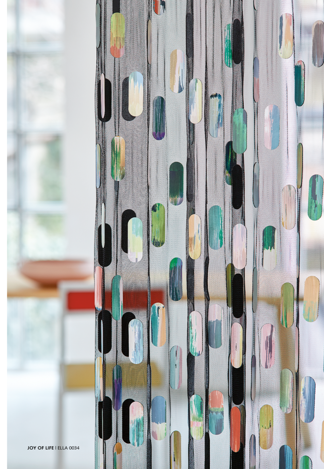
JOY OF LIFE | ELLA 0034