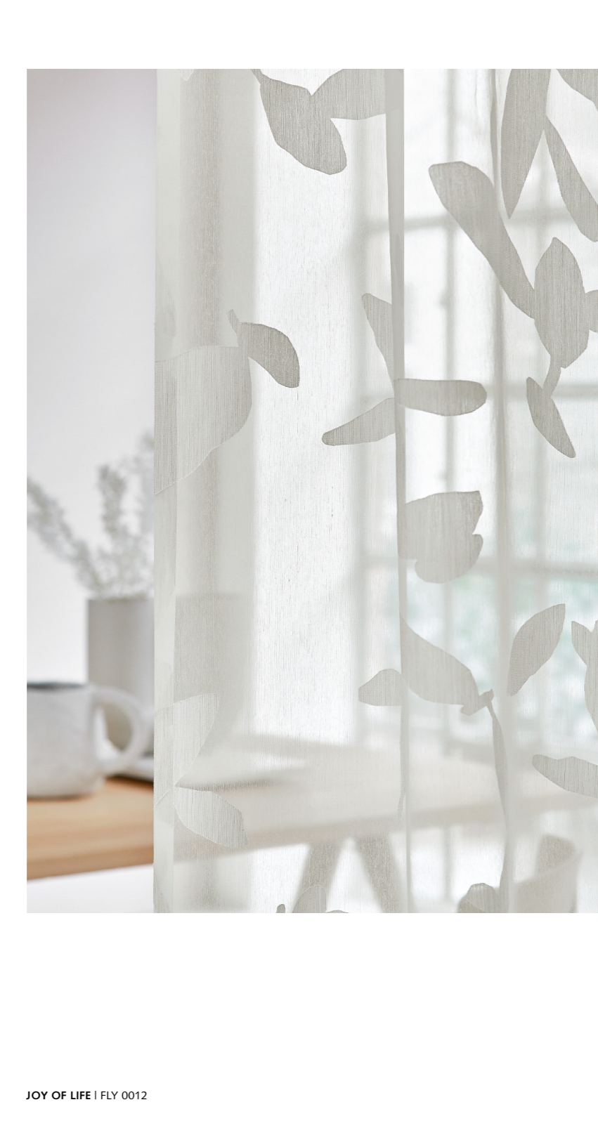
JOY OF LIFE | FLY 0012