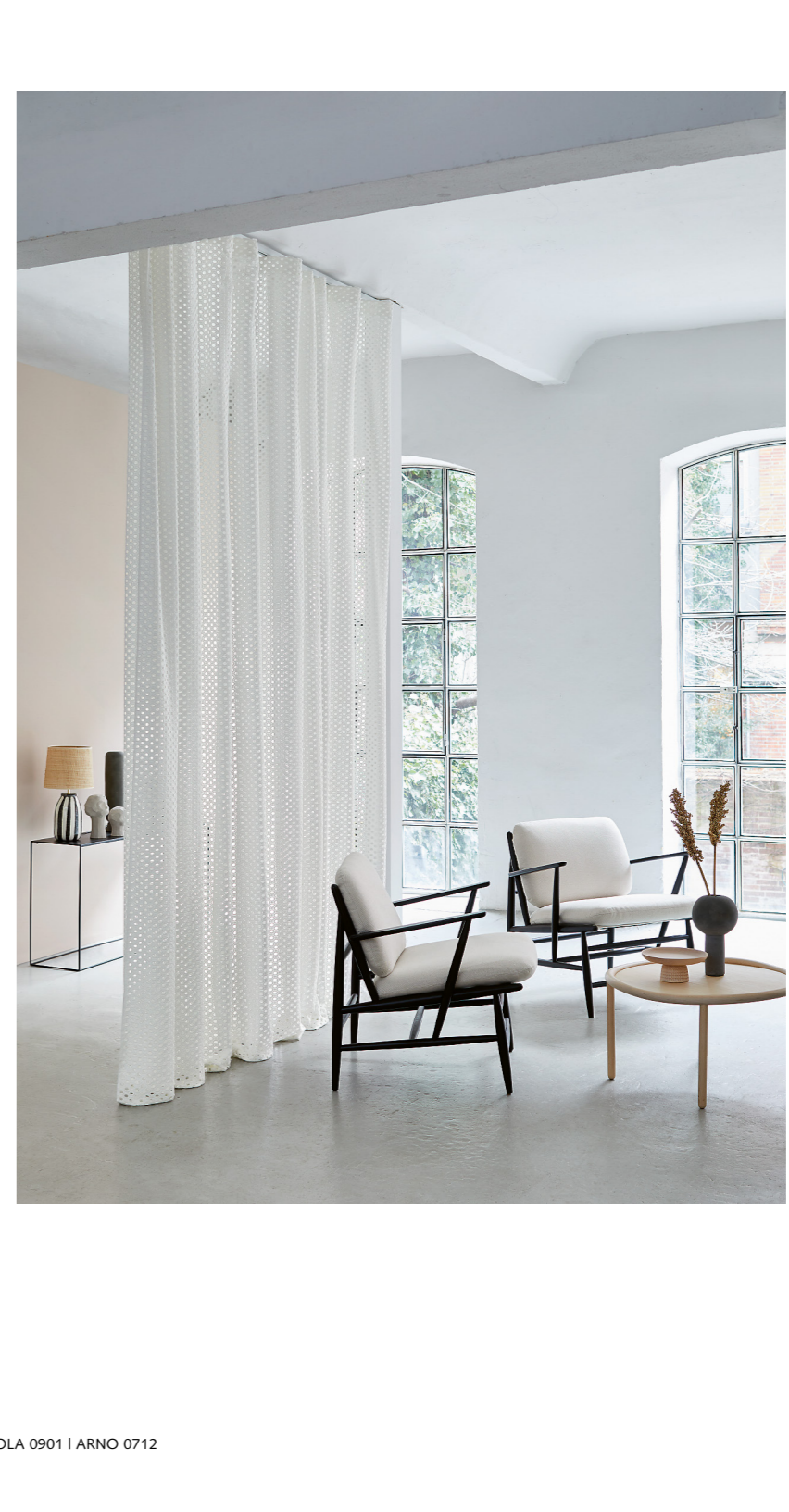
JOY OF LIFE | LOLA 0901 | ARNO 0712