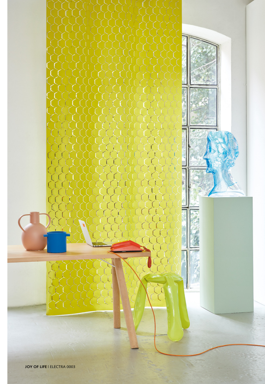
JOY OF LIFE | ELECTRA 0003