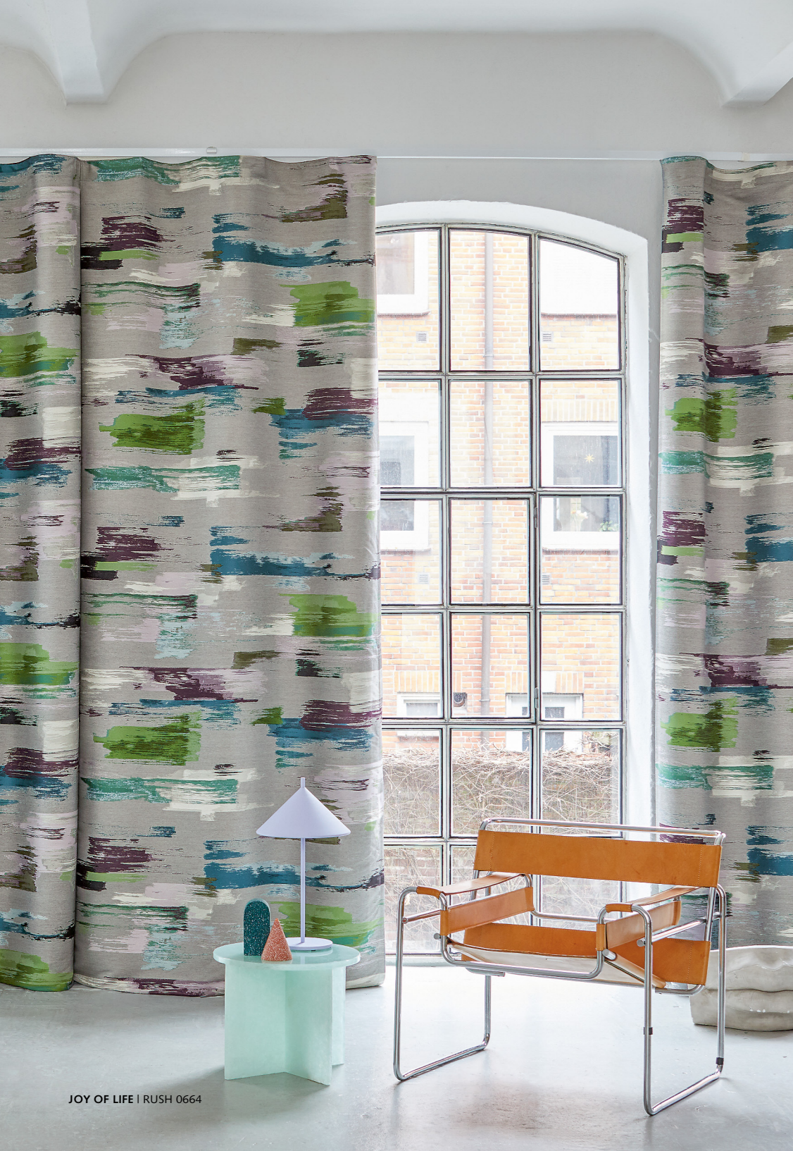
JOY OF LIFE | RUSH 0664