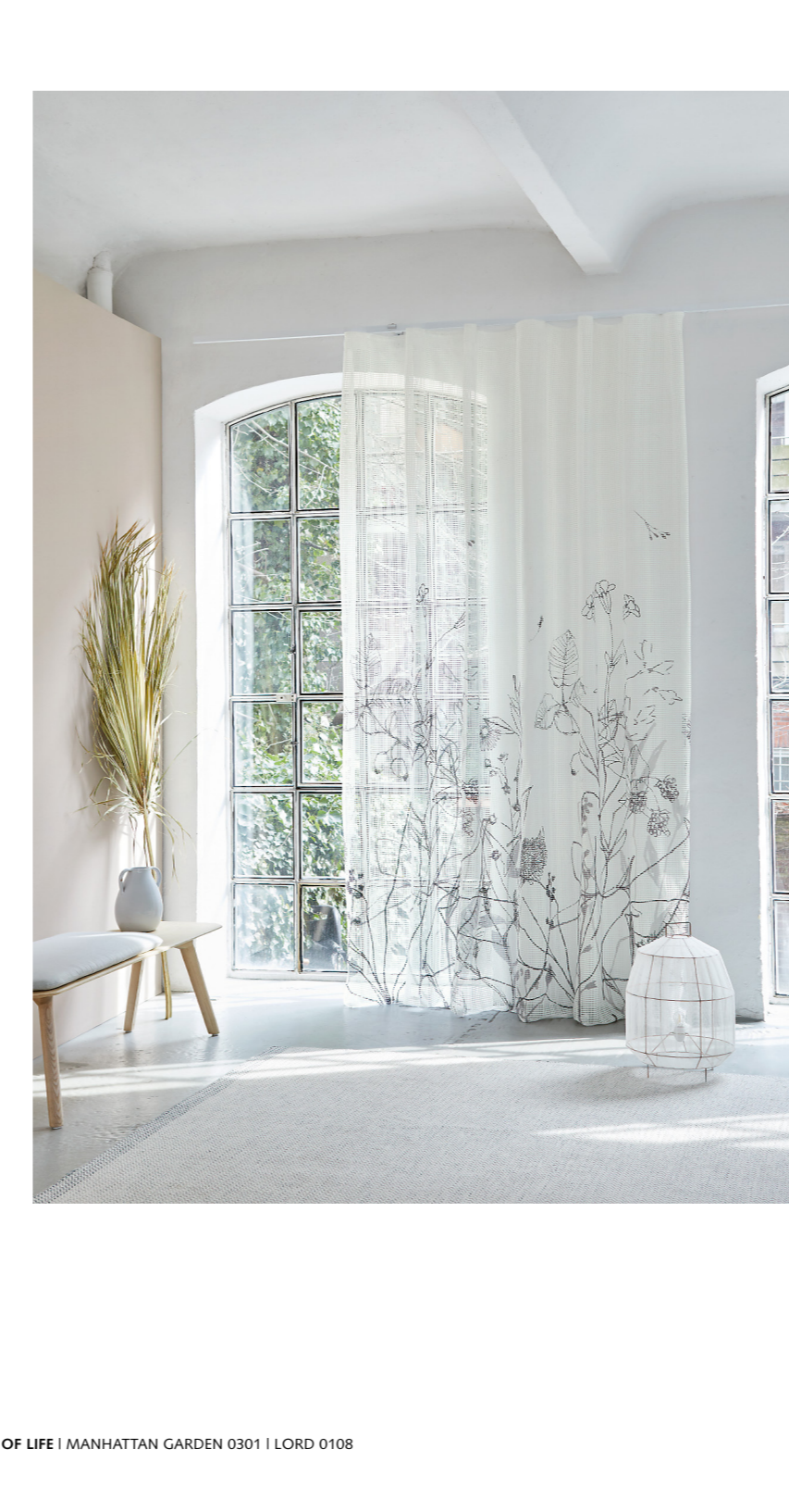
JOY OF LIFE | MANHATTAN GARDEN 0301 | LORD 0108