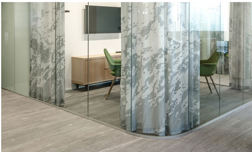
Object: Bank EKI, Interlaken, Switzerland Photo: Marcel Abegglen, L2A Architekten AG, Switzerland

Whether you are looking for curtains, roller blinds, partitions, acoustic panels or any other kind of interior textiles, our range not only offers you unlimited scope in terms of fabric design, it also gives you complete freedom to incorporate textiles into your interior design in any way you like. We recommend taking a look at our website for ideas and examples. Visit creationbaumann.com/references to find various references from each area of application.