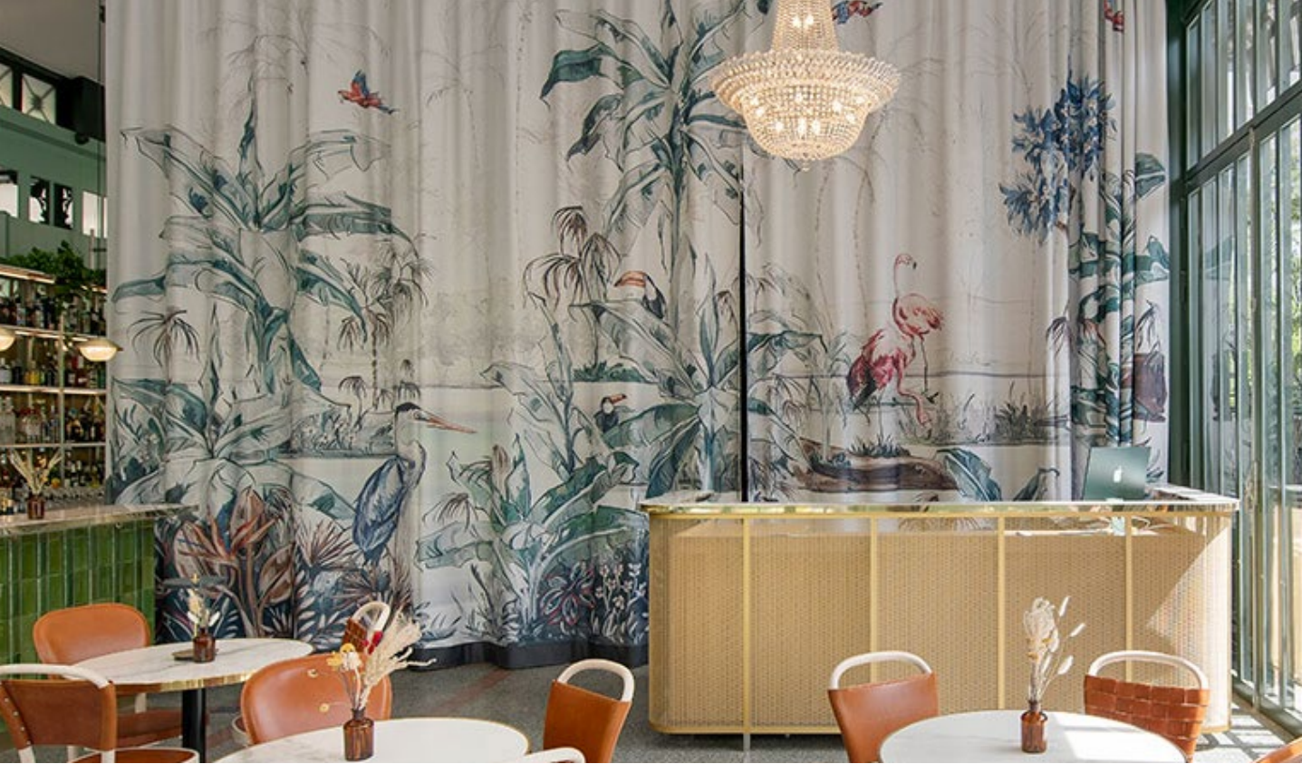
Object: Kiosque des Bastions, Geneva, Switzerland