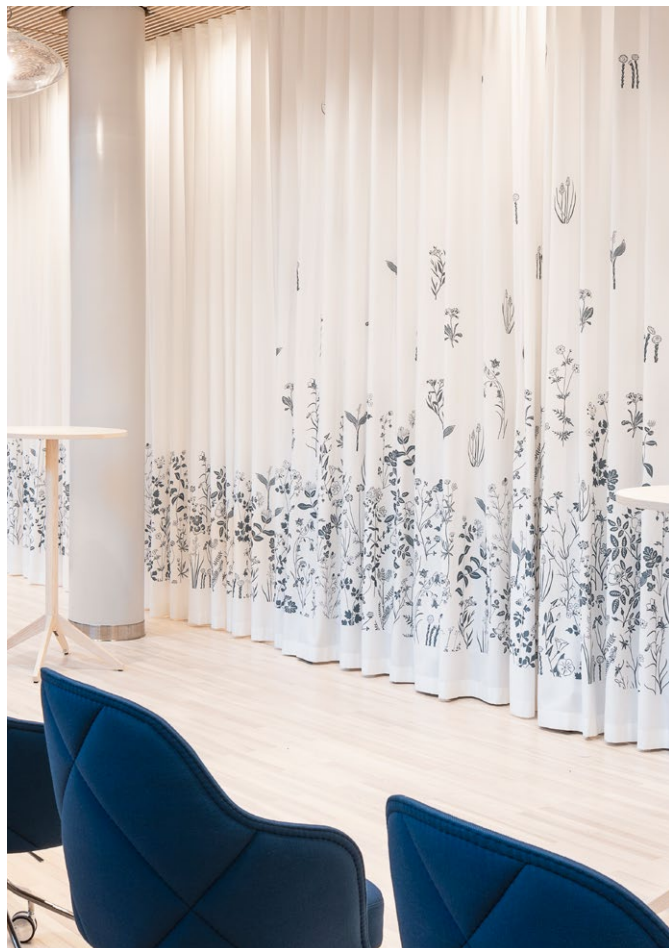
Object: Uppsala Stadshus, Uppsala, Sweden

FREE REIN FOR YOUR CREATIVITY: WE CAN PUT VIRTUALLY ANY IDEA INTO PRODUCTION THANKS TO OUR EXPERTISE, TECHNOLOGY AND EXTENSIVE RANGE OF HIGH-QUALITY BASIC MATERIALS.