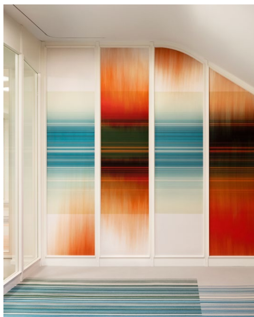
Object: Swiss Textiles, Zurich, Switzerland

However you want to design your fabric: Whether photorealistic motifs, patterns and colours, texts and logos, illustrations – we make sure that just about every idea can go into production. And, of course, you can always rely on exceptional textile and print quality from Création Baumann