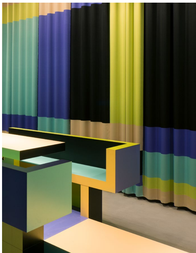
Object: FRAC Nord-Pas de Calais, Dunkerque, France